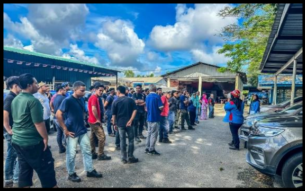
LATIHAN EMERGENCY EVACUATION DRILL MSETIC 2.1.2024