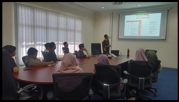
INHOUSE TRAINING FIRE SAFETY AT AVSB 5.6.2024